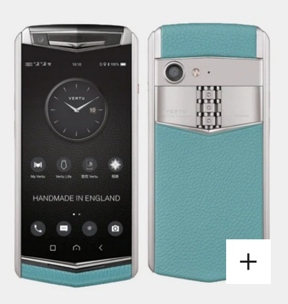
ASTER P SILVER GENTLEMEN BLUE LEATHER