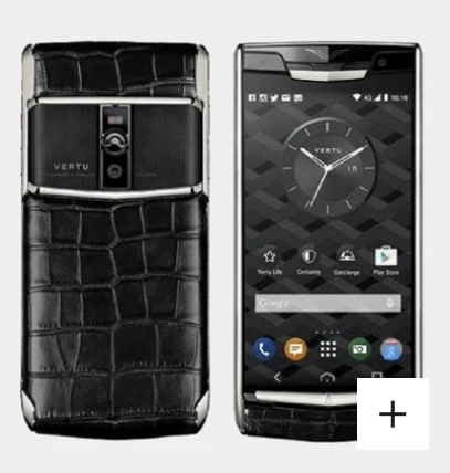
SIGNATURE TOUCH SILVER BLACK ALLIGATOR LEATHER