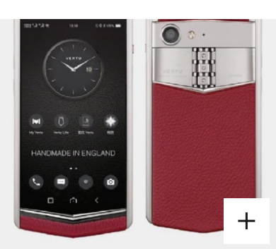
ASTER P SILVER RASPBERRY RED