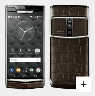
SIGNATURE TOUCH SILVER COCOA BROWN ALLIGATOR