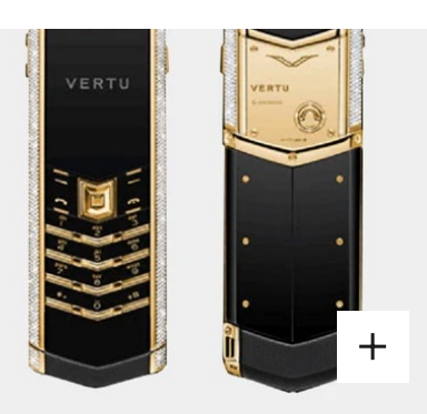
SIGNATURE DIAMOND GOLD BLACK CERAMIC