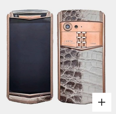
ASTER P ROCOCO DIAMOND LEATHER