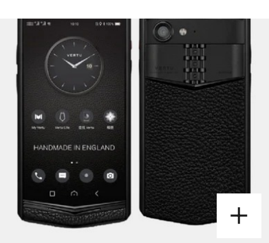
ASTER P PURE BLACK LEATHER